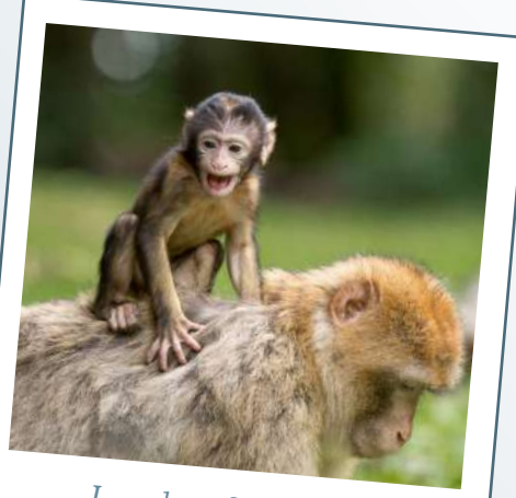
Longleat Safari Park

Approximately 45 minutes away from the property, Longleat Safari Park provides a unique and exciting day out for the whole family. Drive amongst Lions, Rhinos, Giraffes and Monkeys to name a few, before exploring the magnificent house and grounds. You can also make savings by pre-buying tickets in advance through the Longleat website.