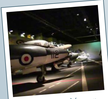
Fleet Air Arm Museum

Two of the best museums the area has to offer are Fleet Air Arm Museum and Haynes International Motor Museum, both located along the A37 towards Yeovil. The naval air museum can be found at RNAS Yeovilton and is Europe's largest naval aircraft museum with flight simulators and much naval history to be explored. Haynes Motor Museum has a large selection of exotic, vintage and super cars on show, perfect for enthusiasts of all ages.